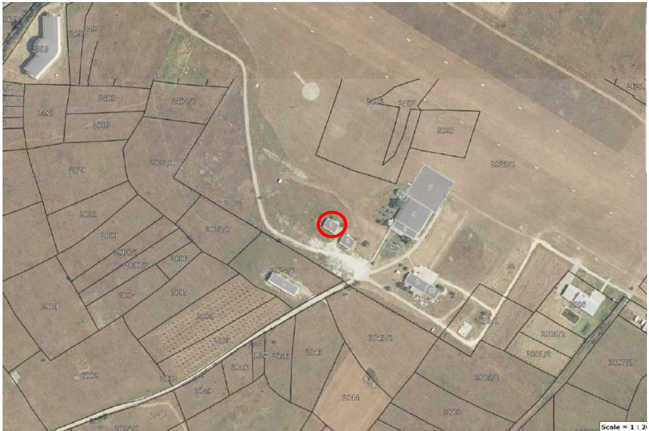
Picture 1 Location of old canteen facility future modern restaurant

The Sports Airfield “Stenkovec” is situated in the Municipality of Cucer Sandevo. At the moment this is a destination of the citizens of Skopje who love aeronautics and actively do some sport. Despite that, the Aero Club Skopje, as the biggest sports airport in Macedonia, has visitors from this country and abroad. The fact that it is only 9 kilometres distanced from the city of Skopje and close to the ring road, makes this place an attractive destination. The area itself is abundant with immaculate nature, greenery and unforgettable landscapes on the Ljuboten peak, the mountain Skopska Crna Gora, as well as the hill Vodno. The airport may offer all the tourist attractions which are related to aeronautical sports, and as the most attractive, we would suggest the Tandem parachute jumps, as well as informative flights with planes. With the interest of enriching the contents is to create a tourist facility that will make this location become Centre for alternative tourism where active tourists will come, people who deal with some aeronautical sports, but it will also be a place where people will simply refresh themselves with coffee or drink far away from the city’s hustle and enjoy the wonderful nature while looking at some of the sport activities that happen on daily basis. The space capacities at the airport provide additional experiences connected to cycling, flying model aircrafts and drones.