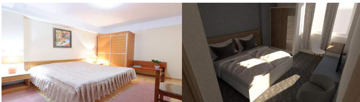
Rooms and apartments