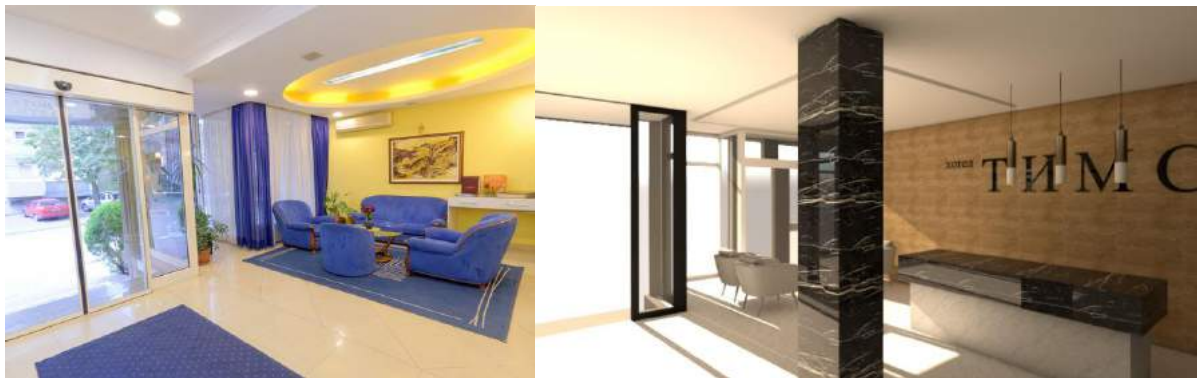
Lobby area – Furniture and carpentry

Examples that include improvement at the hotel: