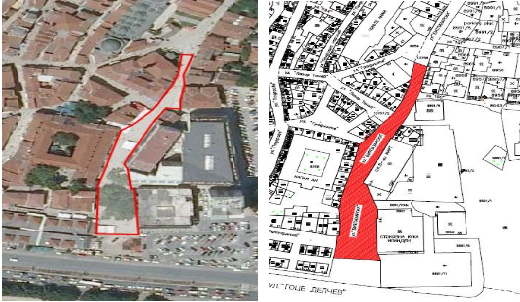
Figure 1 Graphic image of surface pavement