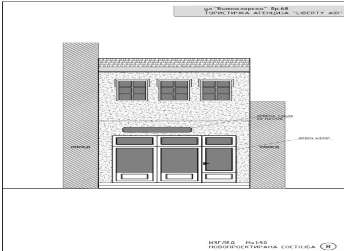
Figure 3 Planned design

Furthermore, the main activity will be the virtualization of cultural heritage in Old Bazaar through introduction of new software application for digital platform that will attract many young people and make Old Bazaar greater touristic attraction. During all activities, the municipality of Cair will build touristic capacity of all stakeholders in Old Bazaar and will advance the relations with rest of bazaars in Balkans.