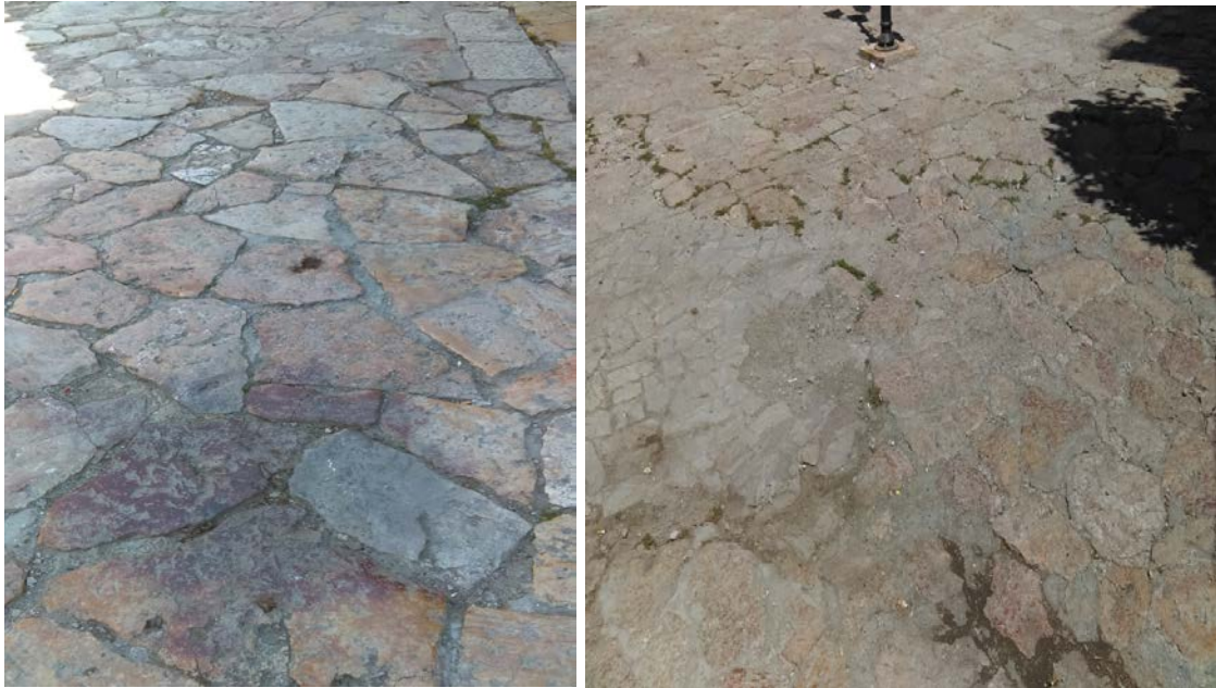
Figure 2 Current situation of cobblestone pavement

The activities for conservation of shops include: