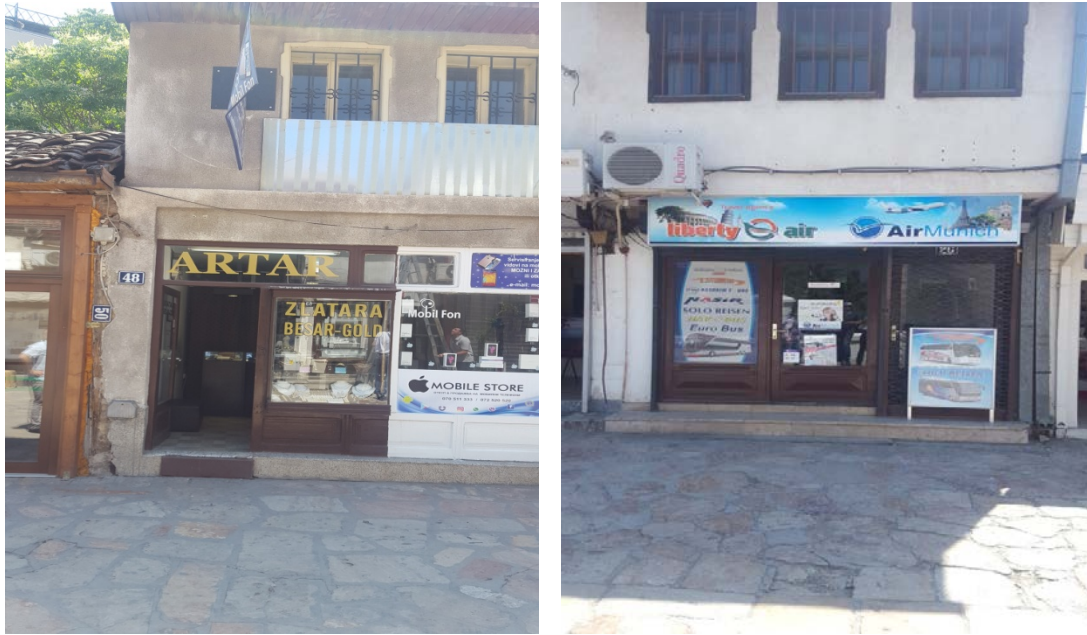
Figure 3 Current situation of shops in Old Bazaar

The selection of shops is based on their degraded situation of shops and expression of interest from owners for replacement of windows.