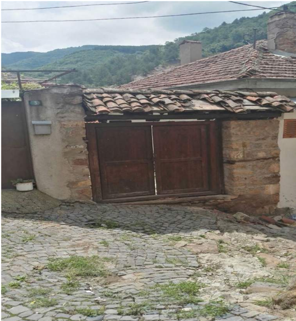
Figure number 11. Current condition (required remediation) Inbound wooden gate

For realization of the mentioned activities in the subproject, according to the conservation conditions issued by the National Institution - National Conservation Center - Skopje, a number of directions and measures are envisaged, which will be respected by the contractors, under dual supervision. Supervised construction work and supervised conservation work.