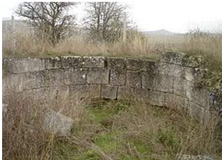
Figure number 8 - View of the circular arch of the apse of Rotonda

A very famous archaeological site near Kratovo is Tranupara - Golemo Gradiste, in the village of Konjuh. This archaeological site, also known as "Golemo Gradiste", was founded at the end of the 5th century or the beginning of the 6th century in the province of Dardania in the Eastern Roman Empire. Golemo Gradiste is the largest and so far the best explored city from the 6th century of the new era in the northeast of Macedonia. At this interesting site, there are remains of a unique church called Rotonda.