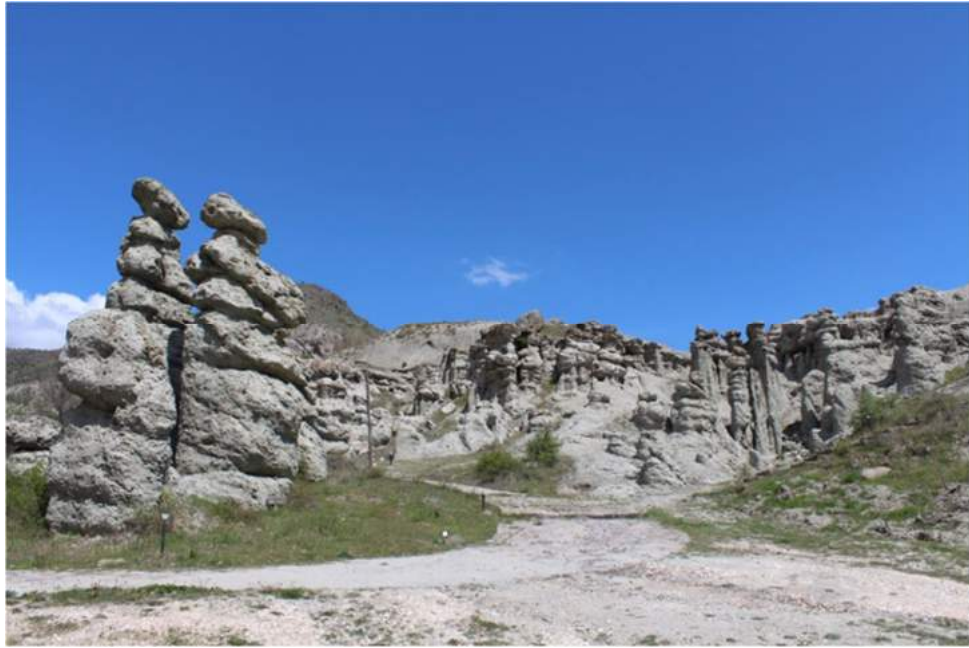
Picture number 7 - Monument of Nature - Site Kamenik Kukli – Kuklica

A very famous archaeological site near Kratovo is Tranupara - Golemo Gradiste, in the village of Konjuh. This archaeological site, also known as "Golemo Gradiste", was founded at the end of the 5th century or the beginning of the 6th century in the province of Dardania in the Eastern Roman Empire. Golemo Gradiste is the largest and so far the best explored city from the 6th century of the new era in the northeast of Macedonia. At this interesting site, there are remains of a unique church called Rotonda.