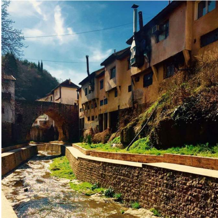
Figure number 6 - One of the bridges in Kratovo

In Kratovo, first monuments of culture, which meets each visitor and simultaneously attract public attention are interesting bridges. There are 6 old bridges - Grofchanski, Barski, Gjorski, Dolnoamami, Argulichki bridge and Radin Bridge for which there are interesting legends circulating about their construction. Kratovo is full of legends and stories.