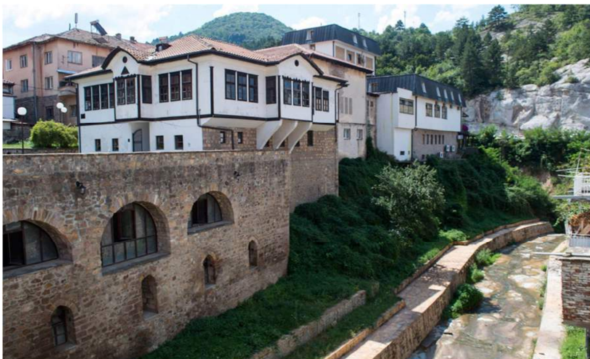
Figure number 4 - House of Culture "Lazar Sofijanov"

House of Culture "Lazar Sofijanov" is located in the city center located in the house of Dadcovi, which is placed under the protection of the Office for protection of cultural heritage as a monument of culture. It has an office space, gallery and plateay for the maintenance of cultural events. Under the authority of the House of Culture is the Multimedia Center which is equipped with a modern cinema hall for projection of films and holding cultural and musical events.