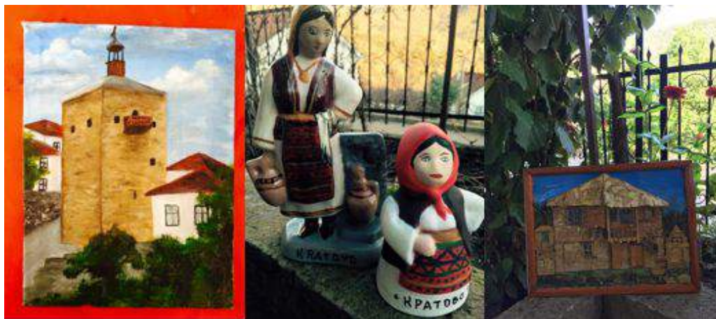
Figure number 9 - Souvenirs from souvenir shops in Kratovo