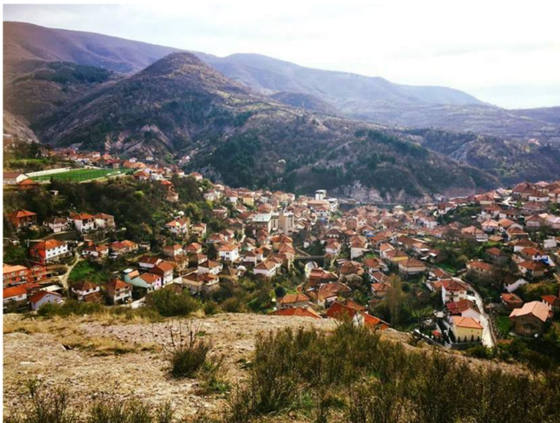
Figure number 2 - Panorama of the city of Kratovo

the Thracian era were found from the reign of Paionian King Avdoleon (315-285 BC).