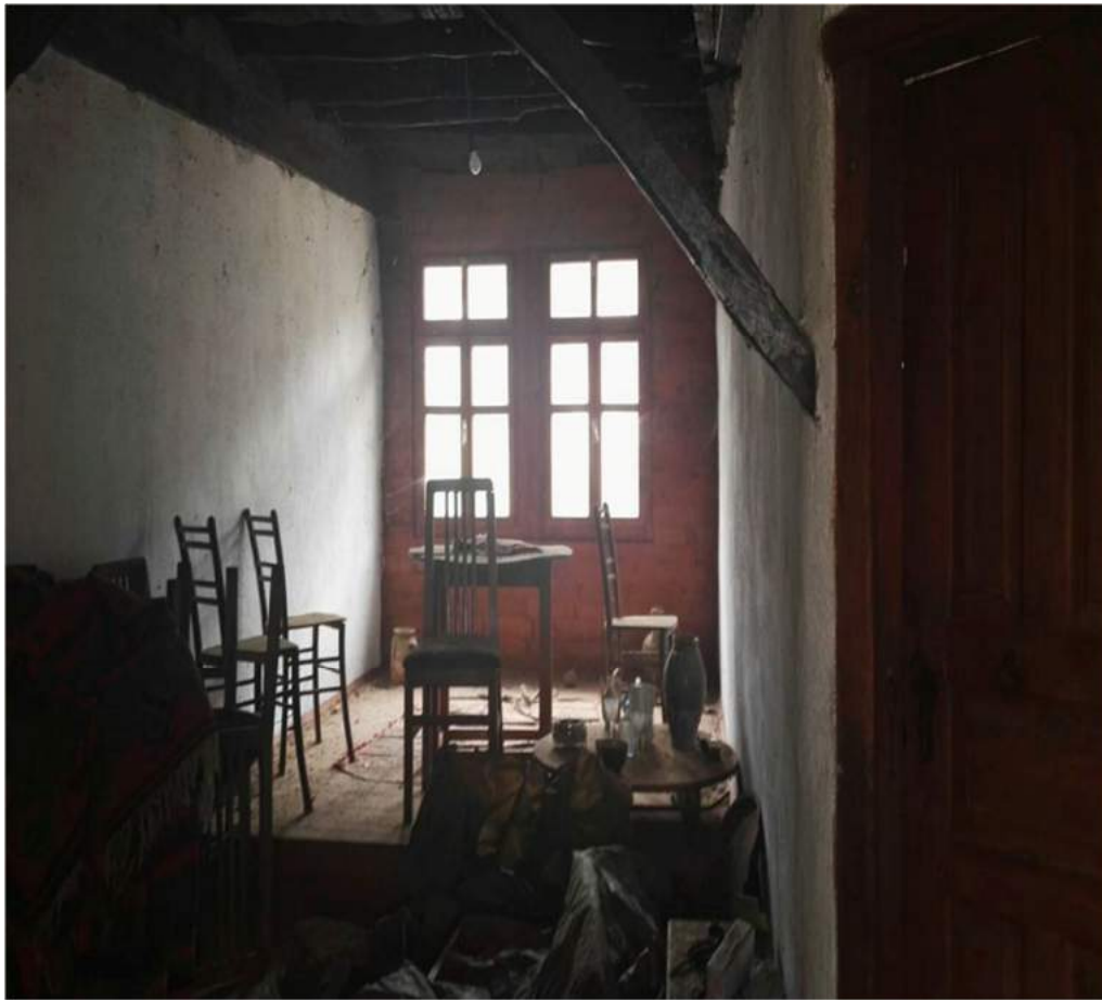
Figure number 10. Current condition (necessary sanitation and interior decoration) - Loggia viewed from the inside

In this sub-project, the internal arrangement of the house will be completed, the yard will be arranged, the main gate will be repaired so that the house is in a condition for use, that is, it will be intended for a place of lodging and will be promoted as a house Monument of Culture.