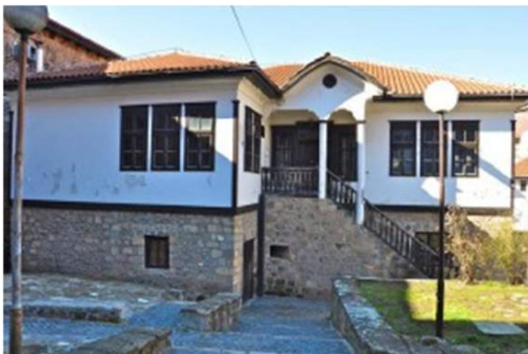
Figure number 3 - Museum of the City of Kratovo

House of Culture "Lazar Sofijanov" is located in the city center located in the house of Dadcovi, which is placed under the protection of the Office for protection of cultural heritage as a monument of culture. It has an office space, gallery and plateay for the maintenance of cultural events. Under the authority of the House of Culture is the Multimedia Center which is equipped with a modern cinema hall for projection of films and holding cultural and musical events.