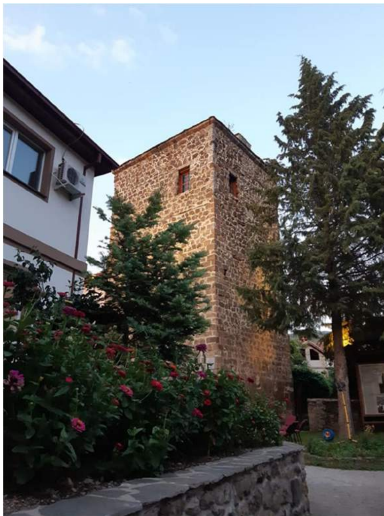
Figure number 5 - One of the towers in Kratovo

Simic's tower is the tallest. The top floor offers an interesting view of the city and other sights such as the Ajducha Bazaar.